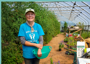
Seeds of Faith Farm

If you are a farmer that is interested in participating in next year's tour please contact your local extension office . Follow the Central Virginia Farm Tours page for annual event updates.