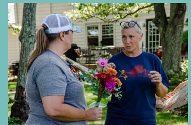
Rosefield Farm and Flowers