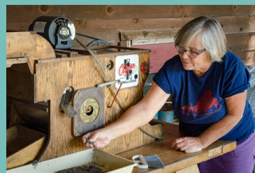
Evergreen Lavender Farm