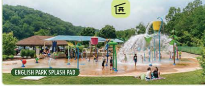
ENGLISH PARK SPLASH PAD