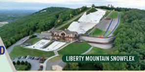
LIBERTY MOUNTAIN SNOWFLEX

CAMPING POOL LAKE TENNIS BASKETBALL PLAYGROUND RV sites and tent camping available May through October. Facilities available to campers including showers.