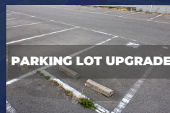
PARKING LOT UPGRADE