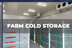
FARM COLD STORAGE