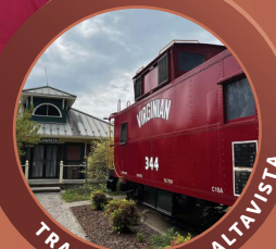
TRAIN STATION, ALTAVISTA