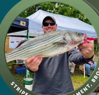
STRIPED BASS TOURNAMENT, BROOKNEAL

Plan your upcoming stay to enjoy seasonal events at nearby farms and venues. Corn mazes, carnivals, farmers markets, fishing tournaments—something fun is happening year round!