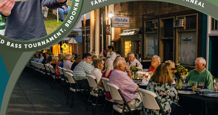
FARM TO TABLE DINNER, BROOKNEAL