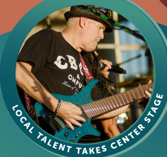
LOCAL TALENT TAKES CENTER STAGE