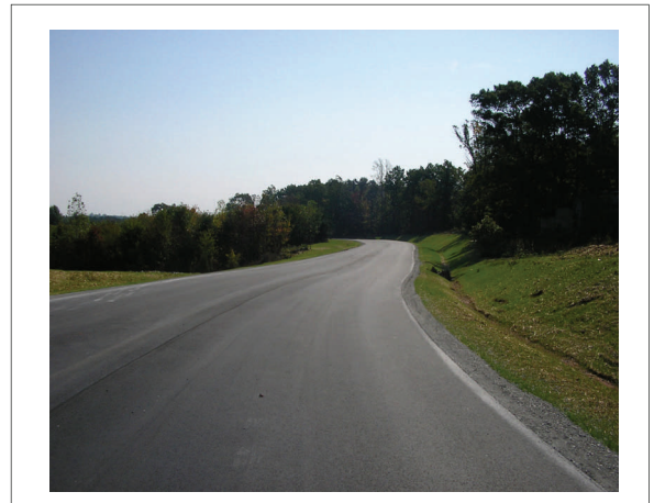
New access road at Seneca Commerce Park

Phase II, extension of the road and waterline, as well as the construction of a new median cross-over on US 29, is scheduled to begin in Spring 2006.