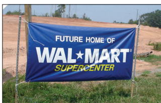
Altavista Commons to open in 2006.

The new shopping center has been named Altavista Commons .