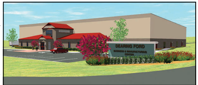
Dearing Ford Business & Manufacturing Center Virtual Building

Campbell County's new Virtual Building is now complete. Developed with the help of the Altavista Industrial Development Authority and a grant from the Virginia Economic Development Partnership, the Virtual Building provides a business location where all preliminary site work has been completed so that construction can begin immediately.